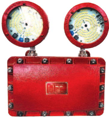
Type of Explosion-Proof Flameproof (Ex d IIB+H2 T6)