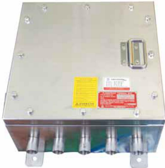
Type of Explosion-Proof Increase Safety (Ex e II T6 IP65)