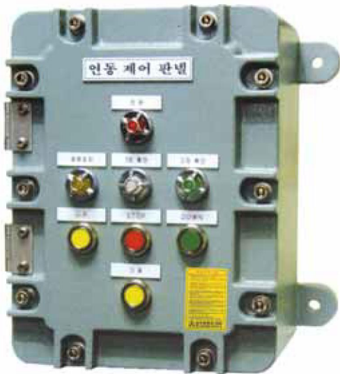
Type of Explosion-Proof Flameproof (Ex d IIB+H2 T6)