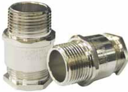
Type of Explosion-Proof Flameproof (Ex d IIC)